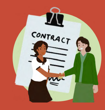
direct, permanent employment