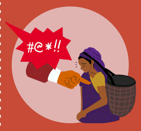
abuse & loss of dignity