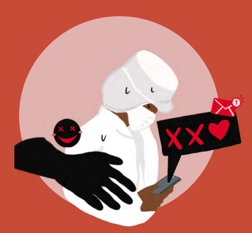
sexual harassment & violence